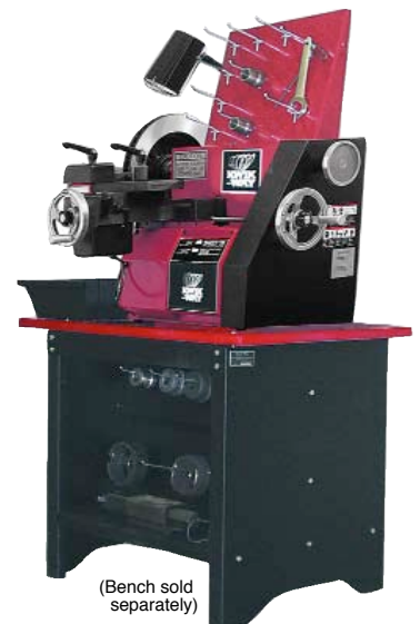
(Bench sold separately)

Heavy Duty Bench (sold separately) 104-0200-00