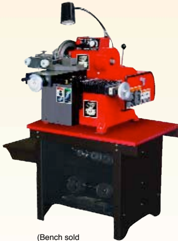
(Bench sold separately)