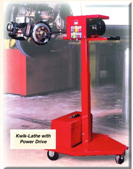
Kwik-Lathe with Power Drive