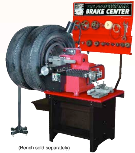
(Bench sold separately)

* Machine Comes Standard with Outboard Support, Dual Wheel Kit, and auto & truck cones