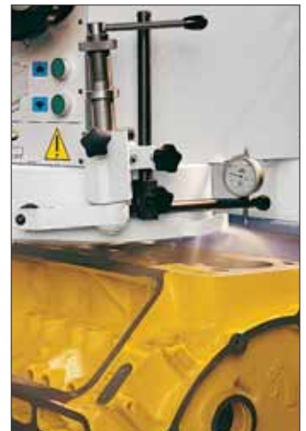
Grinding a cylinder block with segmental wheel.

Top: wheelhead for operation with abrasive segments, cutting tool and milling cutter. Change-over of the various tools is very quick and easy.