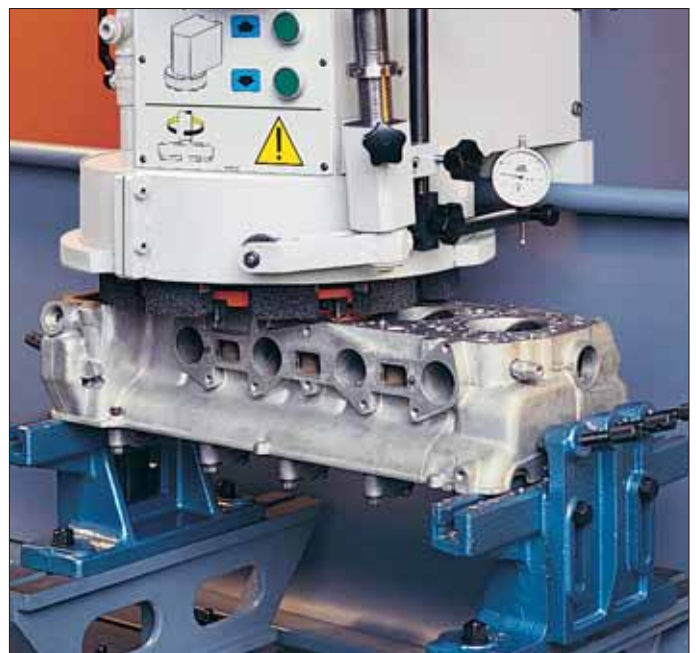
Fig. 2 Milling a cylinder head using insert type milling cutter.