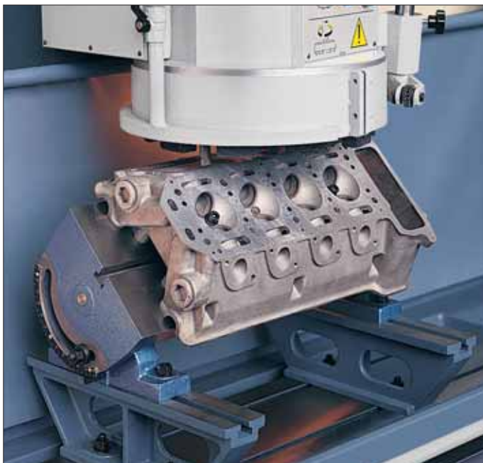
Fig. 1 Reconditioning of manifold mating surfaces with insert type milling tool. The head is clamped on the universal square.