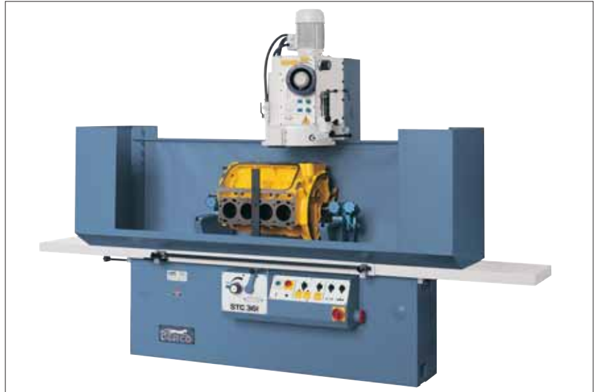
General view of the standard machine version.

- from grinding wheel to tool: 1' - from tool to milling cutter: 3' These are the tool changeover times required to pass from one machining method to another.