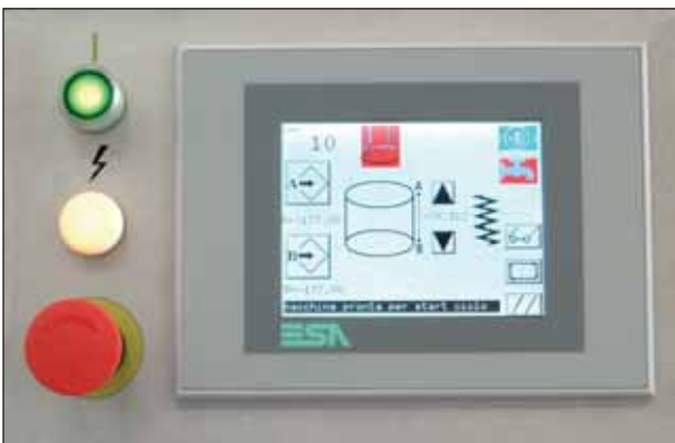
"Touch screen" Control Panel